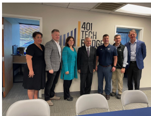
Members of 401 Tech Bridge and NavalX with Sen. Jack Reed

As the Navy seeks to harness cutting-edge technology and innovative solutions, this quarterly meeting underscores the importance of collaboration, knowledge exchange, and community-building in driving forward the mission of enhancing naval capabilities and readiness. 401 Tech Bridge is excited to facilitate these discussions and look forward to the impactful outcomes that will emerge from this gathering.