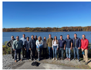
Tech Bridge and NavalX taking in a tour at HavocAI