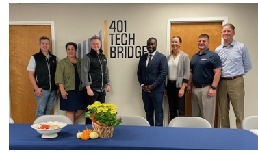
401 Tech Bridge, NavalX and Northeast Tech Bridge with Rep. Gabe Amo